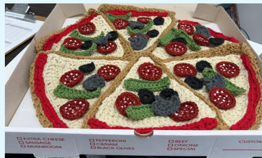
Pizza for restaurant week.